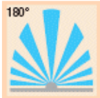
Detection angle 180°