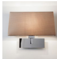
CODE: 1080004 FINISH: POLISHED CHROME