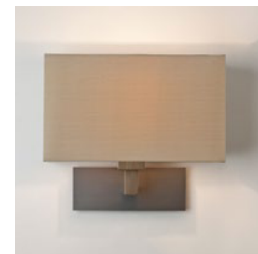
CODE: 1080045 FINISH: BRONZE

TO MAINTAIN THIS PRODUCT TO ITS BEST CONDITION, PLEASE VIEW OUR CARE AND CLEANING GUIDE ON THE SUPPORT SECTION OF THE ASTRO WEBSITE.