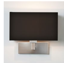
CODE: 1080007 FINISH: MATT NICKEL