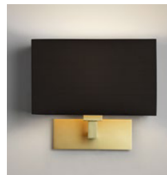
CODE: 1080032 FINISH: MATT GOLD