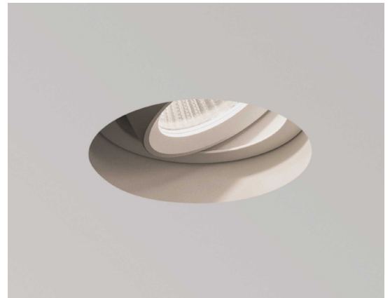
CODE: 1248010 FINISH: TEXTURED WHITE

TO MAINTAIN THIS PRODUCT TO ITS BEST CONDITION, PLEASE VIEW OUR CARE AND CLEANING GUIDE ON THE SUPPORT SECTION OF THE ASTRO WEBSITE.