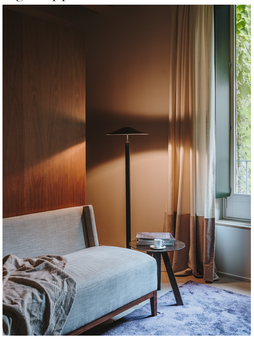
Image may not match reference. LedsC4 reserves the right to amend any of the product's components. The data related to flux, power and colour temperature may be subject to changes made by the manufacturer.