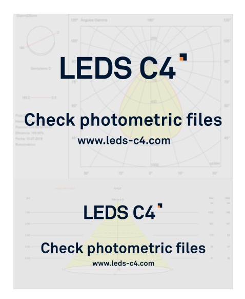
Image may not match reference. LedsC4 reserves the right to amend any of the product's components. The data related to flux, power and colour temperature may be subject to changes made by the manufacturer.