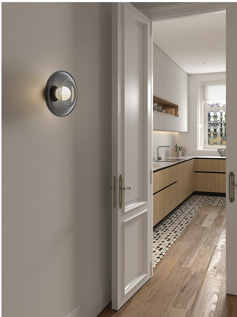
Image may not match reference. LedsC4 reserves the right to amend any of the product's components. The data related to flux, power and colour temperature may be subject to changes made by the manufacturer.