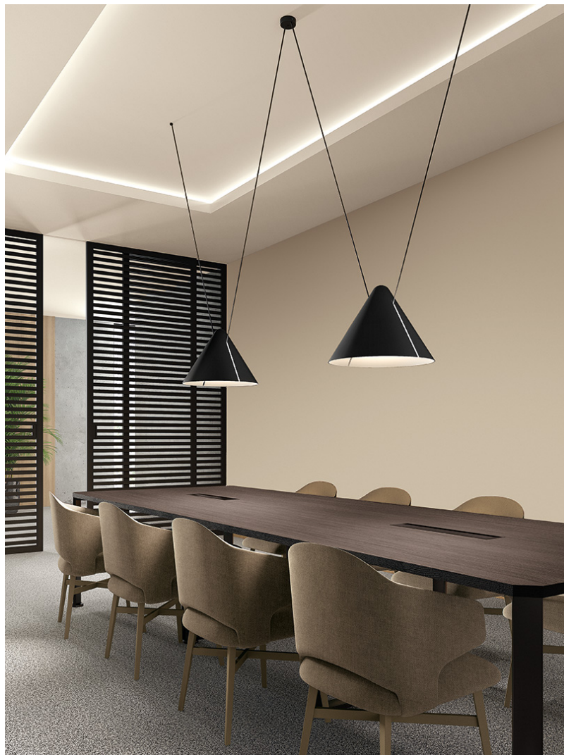
Image may not match reference. LedsC4 reserves the right to amend any of the product's components. The data related to flux, power and colour temperature may be subject to changes made by the manufacturer.