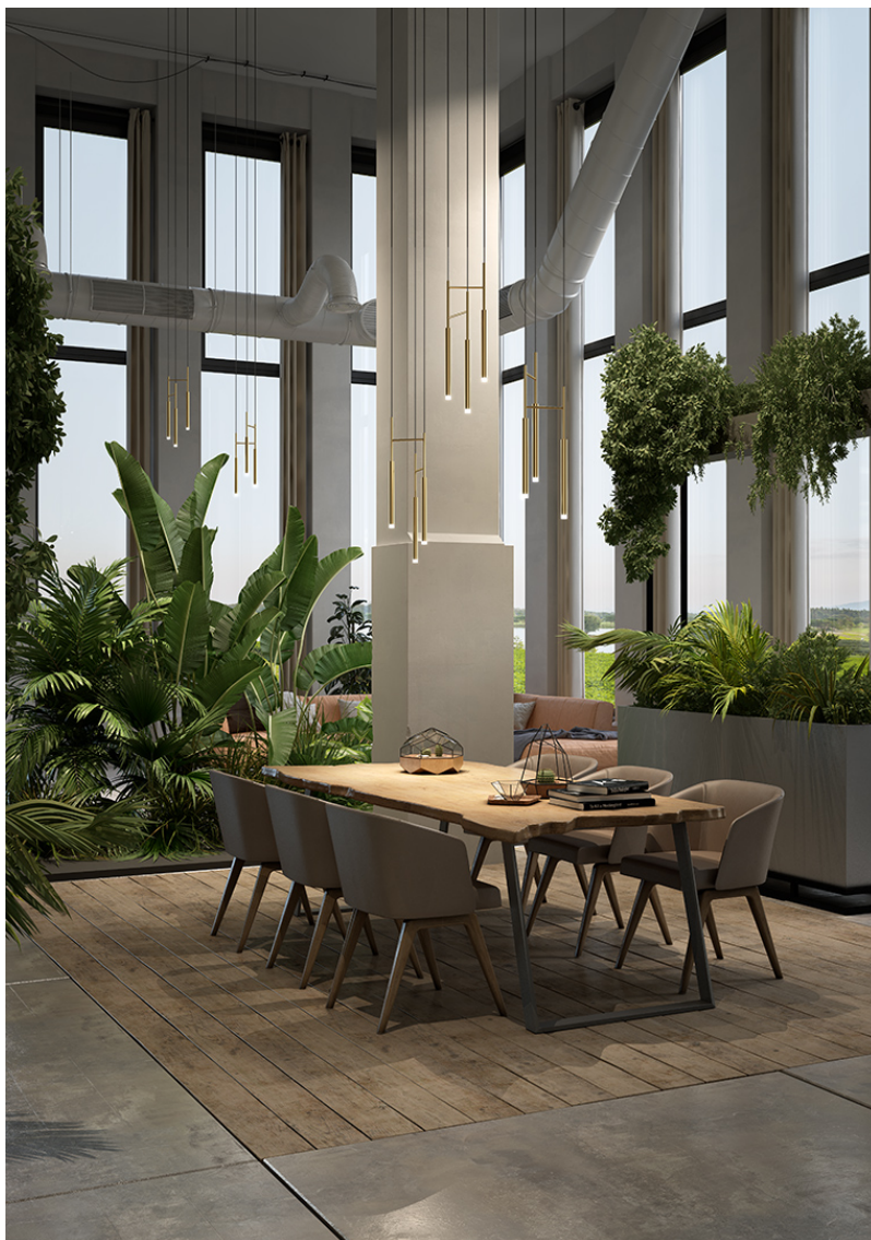
Image may not match reference. LedsC4 reserves the right to amend any of the product's components. The data related to flux, power and colour temperature may be subject to changes made by the manufacturer.