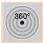
Angle of coverage: 360°