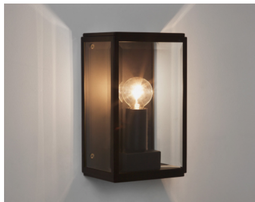
CODE: 1095040 FINISH: TEXTURED BLACK

THIS PRODUCT IS NOT SUITABLE FOR INSTALLATION WITHIN FIVE MILES OF THE COAST. FOR THESE ENVIRONMENTS, PLEASE FILTER PRODUCTS ON THE ASTRO WEBSITE BY 'COASTAL'.